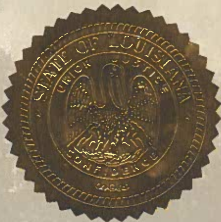
John Bel Edwards Governor

IN WITNESS WHEREOF, I have hereunto set my hand officially and caused to be affixed the Great Seal of the State of Louisiana, at the Capitol, in the City of Baton Rouge, on this 15th day of November A. D., 2021.